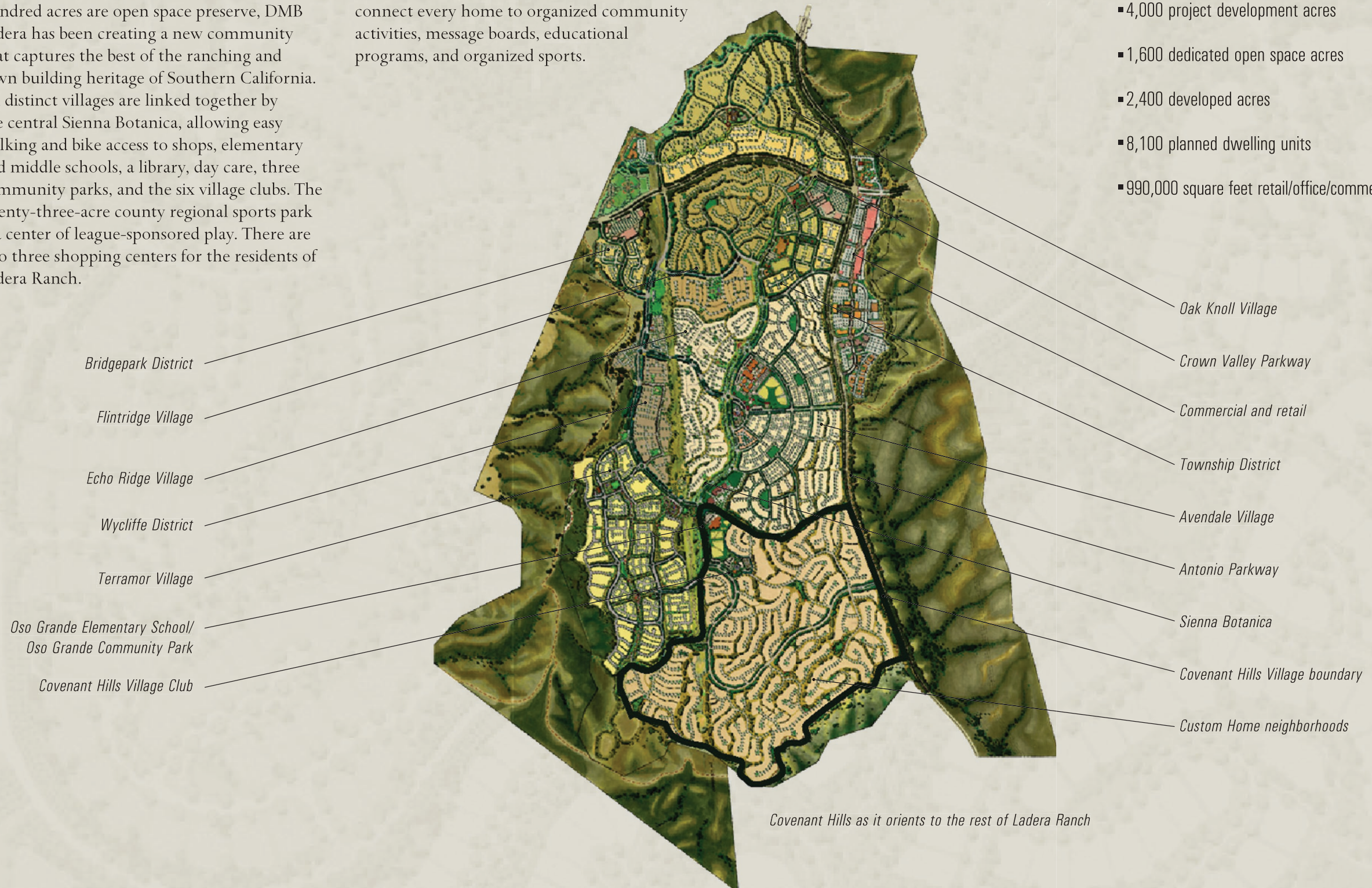
Covenant Hills as it orients to the rest of Ladera Ranch