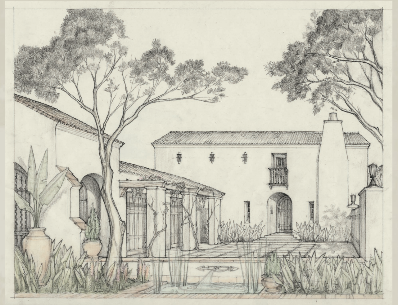
Conceptual mid-block Homesite with deep-recess garage viewed from inside the motor court.