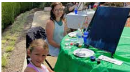
MOTHER'S DAY MASTERPIECES