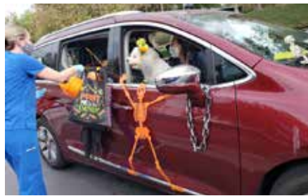
TRAIL OF TREATS