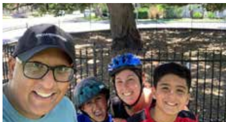
FAMILY SCAVENGER HUNT