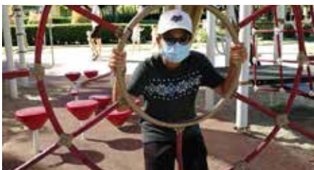
AMAZING TEEN RACE