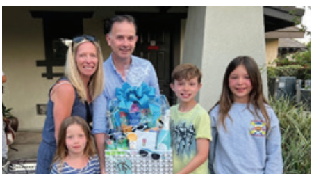
NEW HOMEOWNERS RECEPTION