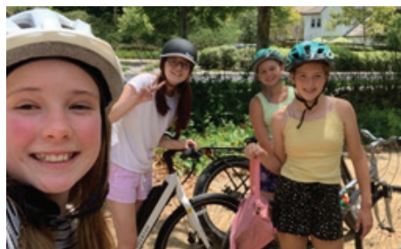
TEEN AMAZING RACE