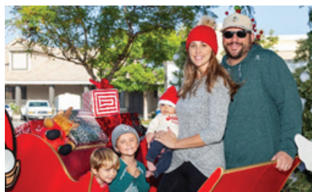
MIRACLE ON MERCANTILE