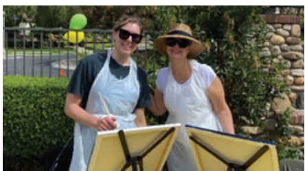
MOTHER'S DAY MASTERPIECES