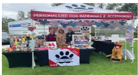
PAWS IN THE PARK