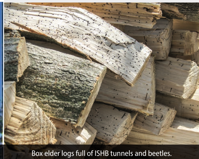
Box elder logs full of ISHB tunnels and beetles.