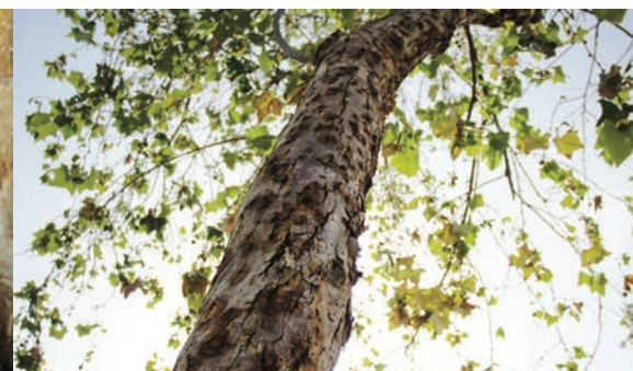
ISHB attacks on Mexican sycamore.