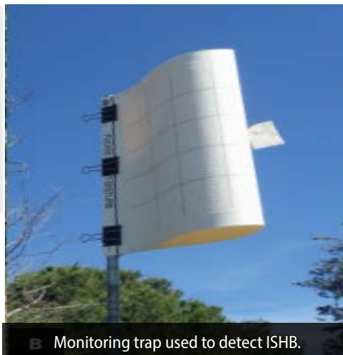
B Monitoring trap used to detect ISHB.