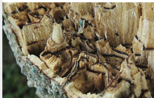
ISHB galleries in a box elder branch.