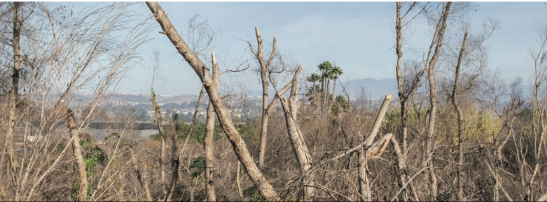
Willows in a San Diego creek devastated by ISHB.