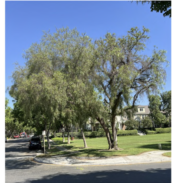
Pepper trees with concerning SCT-like symptoms