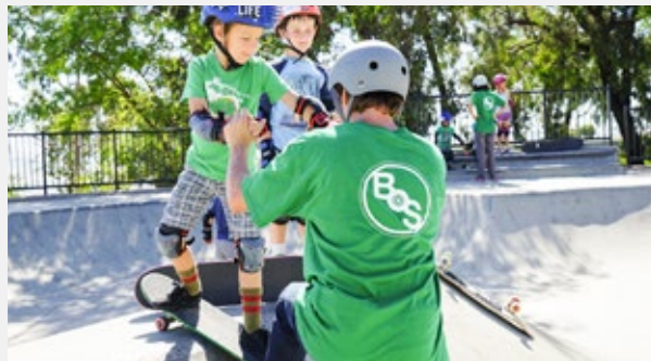
Basics of Skateboarding

Looking for something fun to do this summer? Get an early jump on your summer plans and check out the following camps that will be offered.