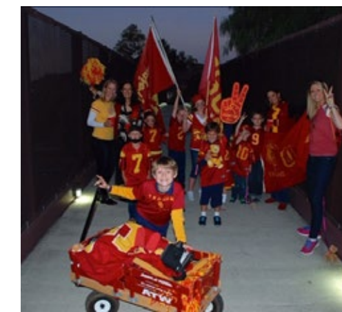
Annual UCLA vs USC rally walk across the Ladera Ranch bridge the night before the rivalry game