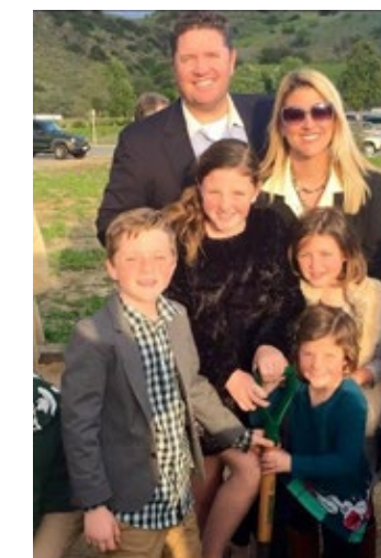
Groundbreaking at Holy Trinity Church site