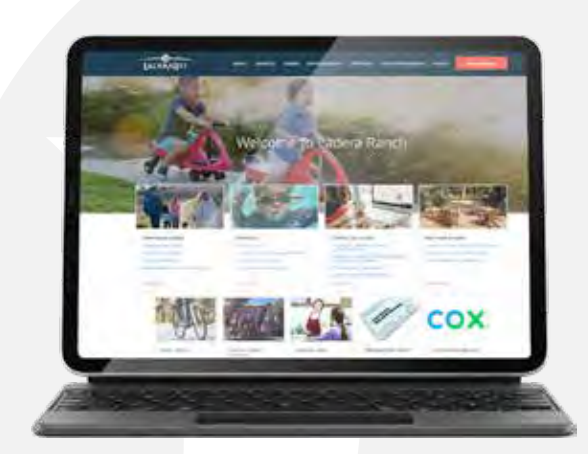
Ladera Happenings weekly newsletter. Watch for it every Thursday!